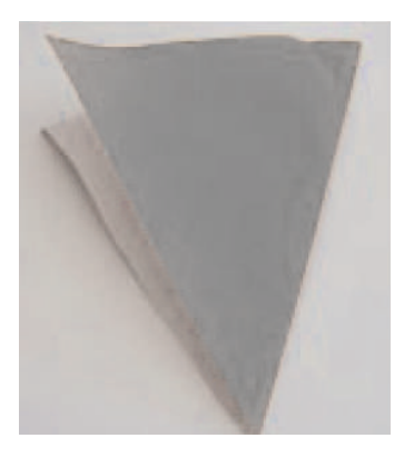
1. Start by folding your square in half diagonally, and creasing carefully.