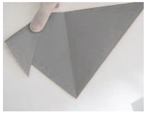
3. Turn the triangle so that the long side is at the top. Fold one of the corners down, as shown in the photo, to form an ear.

2. Fold your triangle in half again to form a crease. Open it back out again.