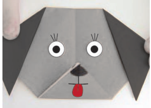
6. Add your dog's features by adding 'sticky eyes' and drawing in the nose…woof!

5. Now fold the bottom point up to form the dog's nose.